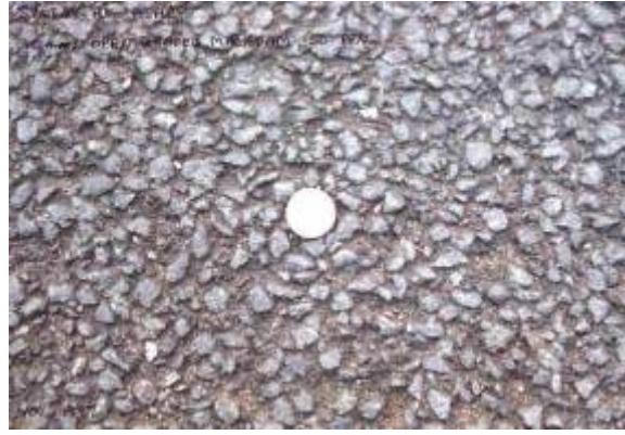
Clogged pores due to dust and mud