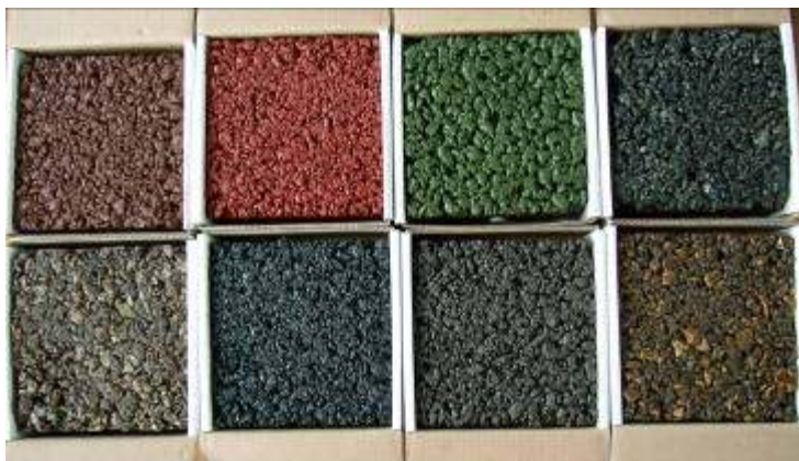
Coloured asphalt samples