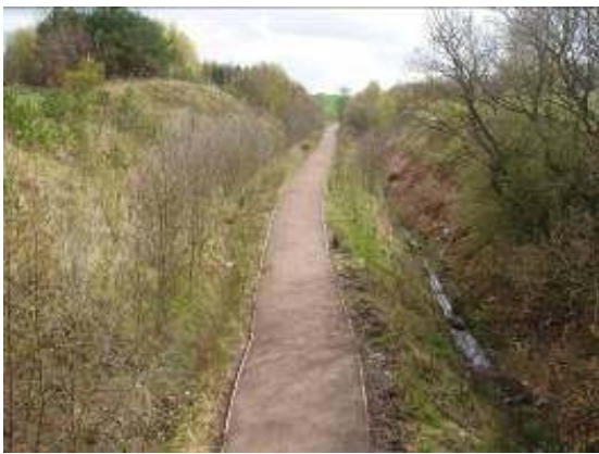
Toptrec (NCN 5 in Staffordshire)

Varies from product to product, but generally slightly cheaper to install than bituminous surfaces. Whole-life costs are generally more expensive than for bituminous surfaces (see Appendix B)