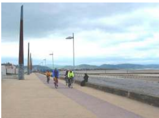
Rhyl Promenade

Cost Surface dressing may cost between £15 - £35 / m2 (material & labour) in addition to the construction cost of the original asphalt surface, depending on aggregate and supplier used.