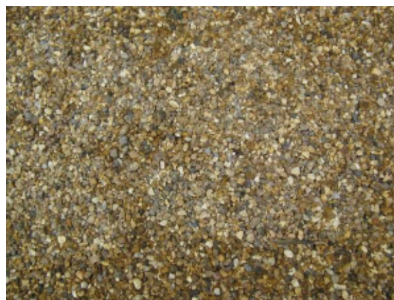
Vegecol at Basingstoke Canal, Woking