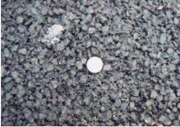
Open pores (fresh porous asphalt)