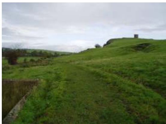
NCN 7 in Lochwinnoch