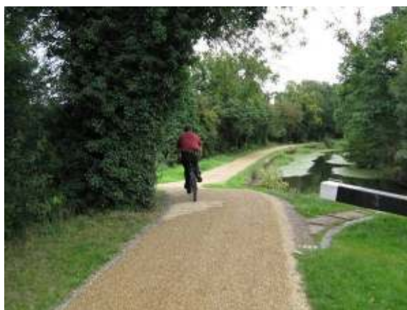
Vegecol at Basingstoke Canal, Woking