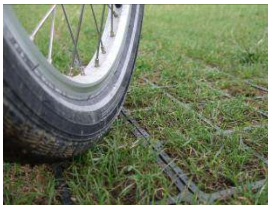
Grass surface in Leighton Linlade