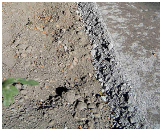
Foamed bitumen path with added cement.