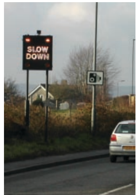
Vehicle activated speed signs mobile or permanent

Recent research has shown that vehicle-actuated signs can be very effective in reducing speeds, without the need for enforcement such as safety cameras. Average speeds can be reduced by between 1–7 mph. They can be particularly useful on the entrance to rural settlements but their use should be limited to avoid an adverse effect on the environment.