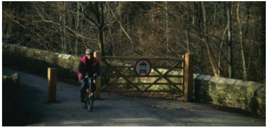
Very effective physical traffic restriction

'Road Ahead Closed' signs combined with either localised closures or access barriers/gates can be effective even if the gates are often unlocked or even left open. The signing acts as a cautionary reminder that to proceed by car along the road may