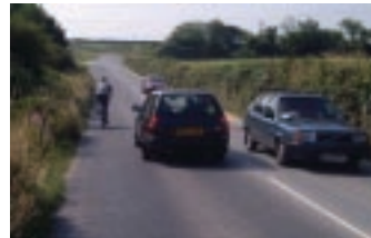
Two way traffic intimidates vulnerable users