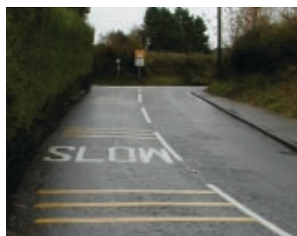
Bar markings - although too near edge for cyclists

loss of traction. The skid resistance of the markings should also be within the specifications set out for the material. The strips must also finish at least 750mm from the edge of the carriageway so that cyclists can avoid them.