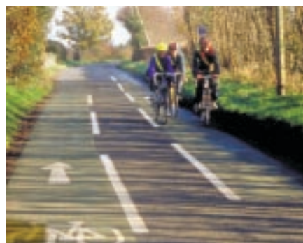
Advisory cycle lane - 'narrows' carriageway and gives prominence over vehicles