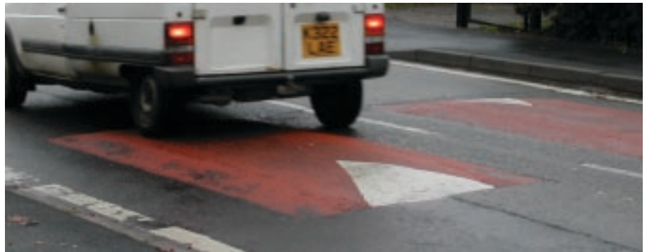
Speed cushions should not be ruled out of rural applications

If the aim of a scheme is to benefit vulnerable users and encourage people to use alternative modes (e.g. public transport)