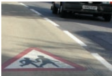
Contrasting colour/texture and clear warning message

change in surroundings to the motorist and therefore a need to alter vehicle speed. As with roadmarkings it is essential to leave enough clear carriageway surface so that cyclists can bypass any harsh changes in surface and have a smooth uninterrupted route.