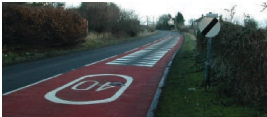
'Dragon's Teeth' and surface treatment on approach to rural speed limit

Each individual Highway Authority has their own preference as to the style of road marking layout that they use at entrances to villages or the approach to hazards. Some Authorities have adopted the practice of installing transverse bar markings and reapplying the roadmarking material to create height and produce a 'rumble strip'. These should not be placed on bends or steep gradients due to risk of