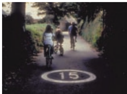
Advisory speed limit - minimalist signing

This document outlines some of the types of measures that can be used on rural minor roads. It considers their appropriateness for different applications, the results that can be expected and the design details that could be considered, especially with regard to their effect on vulnerable road users. Existing schemes of this type are very few compared to urban equivalents and therefore more trials are needed in this area.