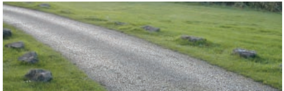
Single lane with wide verge and natural stone replaces white lining and edge marker posts