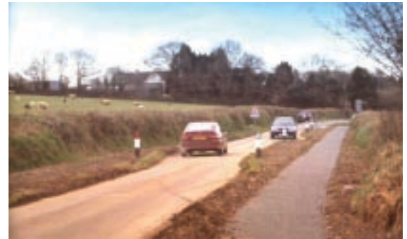
THE SOLUTION: single lane with passing places and new verge path