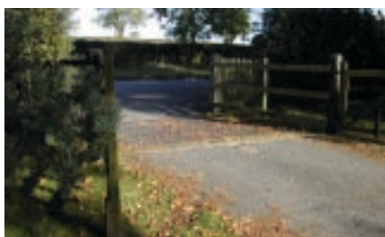
False cattle grid combined with gates

An innovative use of a traditional 'rumble' device can be the installation of a cattle grid (or imitation version) which will cause the same effect to a motorist, but with a bypass, plates or bridging sections for cyclists and horse-riders.